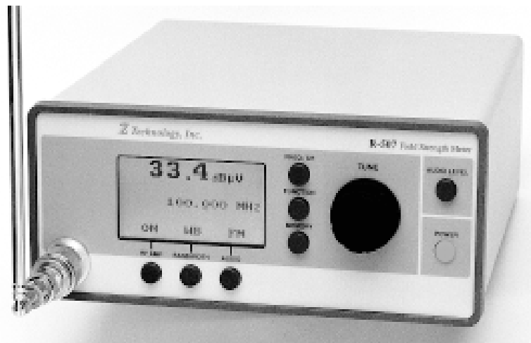
R-507 Field Strength Meter with DTV capability; heart of the S5007DTV system

turer provided Antenna Factors, these Factors can be loaded into the R-507. In Direct Readout mode, the LCD displays signal level in dBuV/meter, the critical measurement unit best suited for transmission testing.