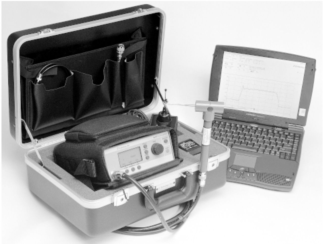
S5007DTV Measurement System with Spectrum software plotting a digital TV signal

System for Field Measurement and Documentation of Digital and Analog Television Signals